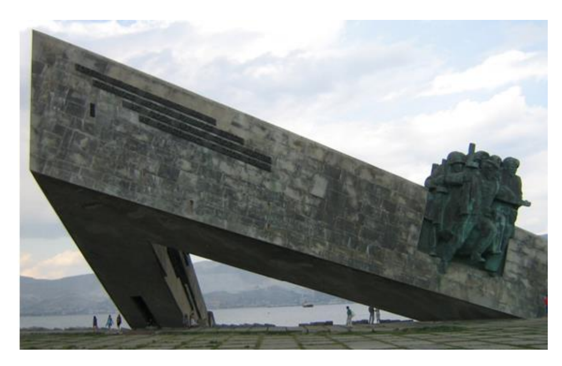
Figure 3: The Malaya Zemlya Memorial Complex in Novorossiysk

The question of what the Malaya Zemlya landing actually achieved, beyond its propaganda value and tying down German forces, is worthy of further consideration. Grechko claims that the operation created favourable conditions for the liberation of Novorossiysk, <sup>63</sup> but this view is difficult to support, as the city was not recaptured until a full seven months after the landing operation and after the Germans had already decided to withdraw the whole of Seventeenth Army from the Kuban Bridgehead. Several writers, including Tieke, note that the presence of the Soviet forces at Malaya Zemlya prevented the Germans from using the port facilities at Novorossiysk.<sup>64</sup> This argument is also questionable. There were already significant Red Army forces on the high ground on the eastern side of Tsemess Bay, where the front line had been static since September 1942. These forces provided artillery support for the landing operation, so they would also have been able to threaten any German vessels attempting to enter or exit the port even if the beachhead had been eliminated. Furthermore, the German-held ports and airfields further to the rear were sufficient for Seventeenth Army's supply needs. During March, for example, the supply and evacuation totals by sea and air were as follows:<sup>65</sup>