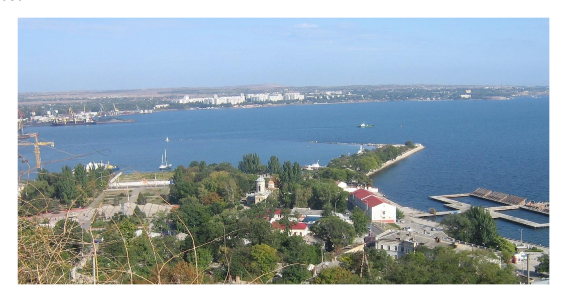
Figure 5: Kerch Harbour

The plan for the final transport was issued by the Kerch Straits Command on 6 October. This order listed the last units to be withdrawn on as 97th Jäger Division and parts of 4th Mountain Division and 370th Infantry Division, along with the final elements of the Seventeenth Army troops, supporting flak troops and the garrison on Kosa Tuzla island. The specified embarkation points were Iliych, both sides of Maliy Kut and the south side of Kosa Tuzla. Most of the transports were to sail to Cape Yenikale and Zhukovka, to the east of Kerch, with some docking at Kerch Harbour's south mole and fishing port and at Cape Ak Burun and Kamysh Burun Bay, to the south of the harbour.